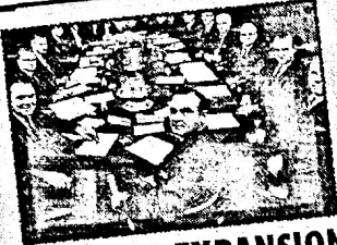
BUSINESS EXPANSION: CONGLOMERATES & FRANCHISES

Answer the following questions on how each of the trends listed changed American society.