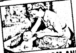
THE BABY BOOM AND CHANGING ROLES OF WOMEN

Answer the following questions on how each of the trends listed changed American society.