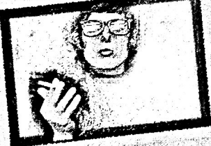
ROCK 'N ROLL & THE BEAT MOVEMENT

What subjects did TV tend to present to the American audience? What did it avoid?