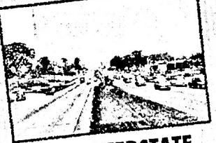
THE INTERSTATE HIGHWAY SYSTEM & AUTO MANIA

What were the effects of consumerism? What did people buy?